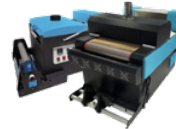
DTF Shaker, Dryer & Roller (Medium/Large Format)