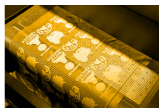
Cure in a Dryer