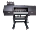
DTF Printer (Medium/Large Format)