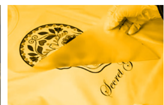
Press to Garment