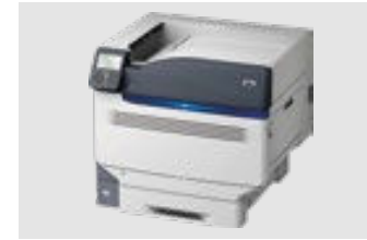
OKI PRO9541WT MAX: DIN A3XL/12.5x19"