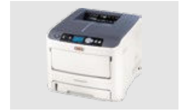
OKI PRO6410 NEON MAX: DIN A4XL/8.5x17"