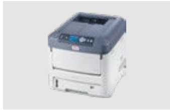
OKI PRO7411WT ES7411WT/C711WT MAX: DIN A4XL/8.5x17"