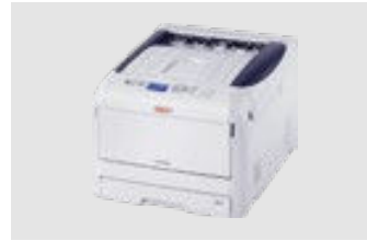
CRIO 8432WDT* OKI PRO8432WT MAX: DIN A3XL/11.8x19" *CRIO IS ONLY AVAILABLE IN NORTH & SOUTH AMERICA