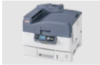
OKI PRO920WT ES9420WT/C920WT MAX: DIN A3XL/12.5x19"