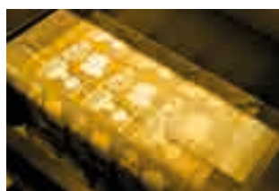
Cure in a Dryer