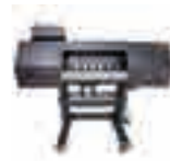
DTF Printer (Medium/Large Format)