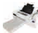
DTF/DTF Modified Printer (Small Format)