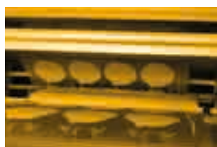
Apply Glue/Powder to wet Ink