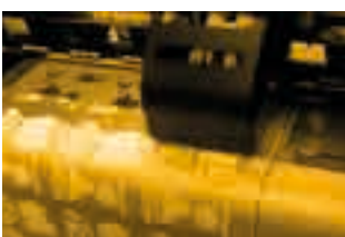
Print Design on Film using a RIP Software