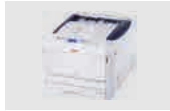
OKI PRO8432WT MAX: DIN A3XL/11.8x19"