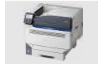
OKI PRO9541WT MAX: DIN A3XL/12.5x19"