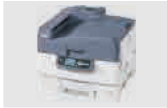
OKI PRO920WT ES9420WT/C920WT MAX: DIN A3XL/12.5x19"