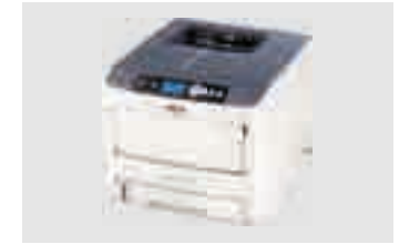
OKI PRO6410 NEON MAX: DIN A4XL/8.5x17"