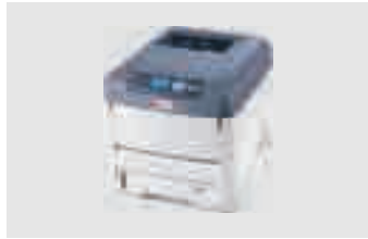
OKI PRO7411WT ES7411WT/C711WT MAX: DIN A4XL/8.5x17"