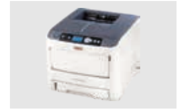
OKI PRO6410 NEON MAX: A4XL/8.5x17"