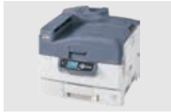
OKI PRO920WT ES9420WT/C920WT MAX: A3XL/12.5x19"