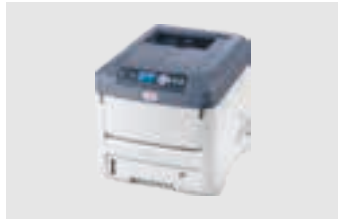
OKI PRO7411WT ES7411WT/C711WT MAX: A4XL/8.5x17"