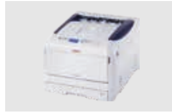
OKI PRO8432WT MAX: A3XL/11.8x19"