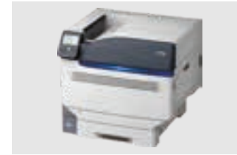
OKI PRO9541 ES9541WT/C941WT MAX: A3XL/12.5x19"