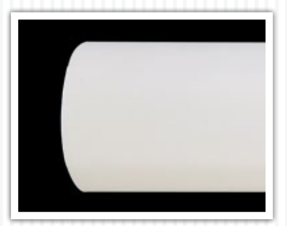
CARRIER TAPE SOLVENT