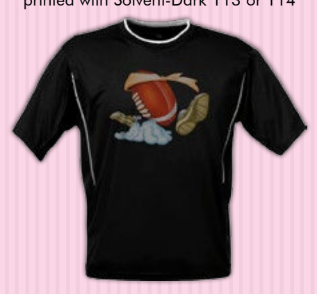
NOT SUITABLE! (COLOR MIGRATION ON POLYESTER)